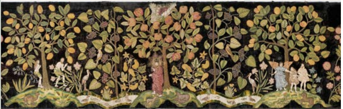
The Garden of Eden, British Embroidery, late 1500s Metropolitan Museum of Art, New York