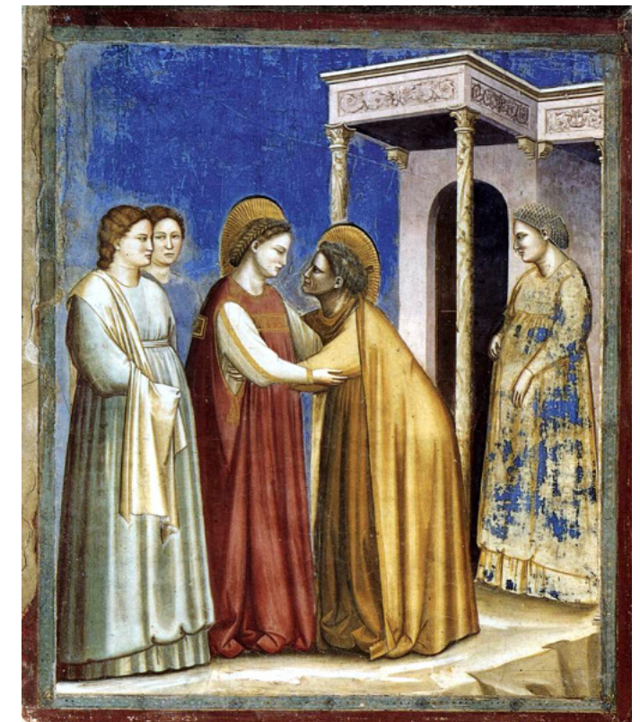
The Visitation. Giotto di Bondone, 1306. Scrovegni Chapel, Padua, Italy