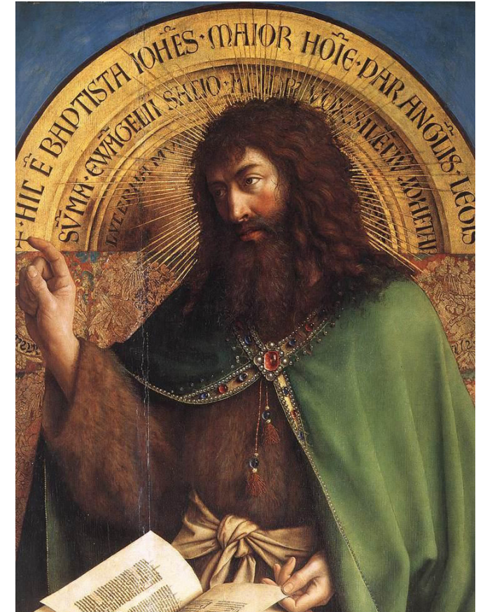
The Ghent Altarpiece, detail - John the Baptist, Jan van Eyck, 1432. Cathedral of St. Bavo, Ghent, Belgium.