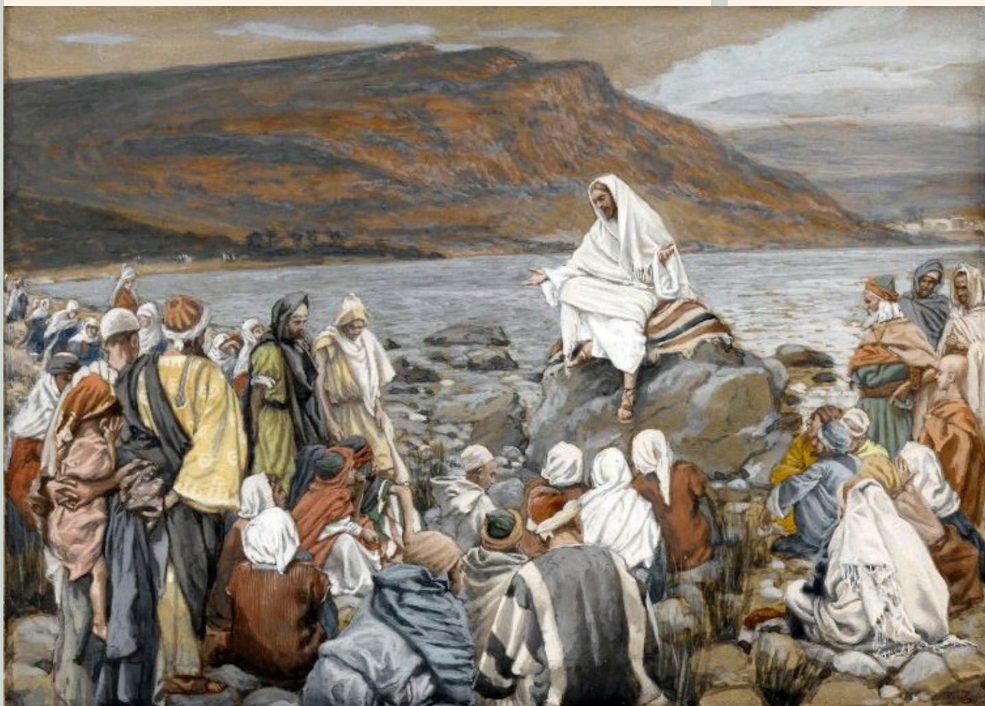
Jesus Teaches the People by the Sea, James Tissot, 1890. Brooklyn Museum