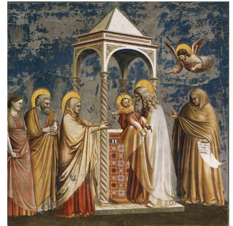
The Presentation of the Infant Jesus in the Temple Giotto, Scrovegni Chapel, Padua, Italy, c. 1305.