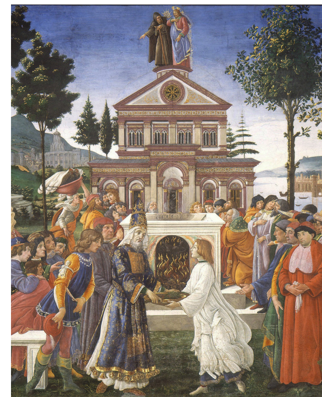
The Three Temptations of Christ, detail Sistine Chapel, Rome. Sandro Botticelli,