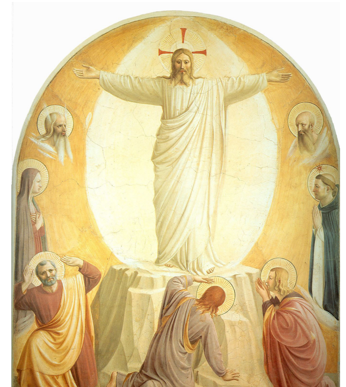
The Transfiguration Fra Angelico, 1440-41