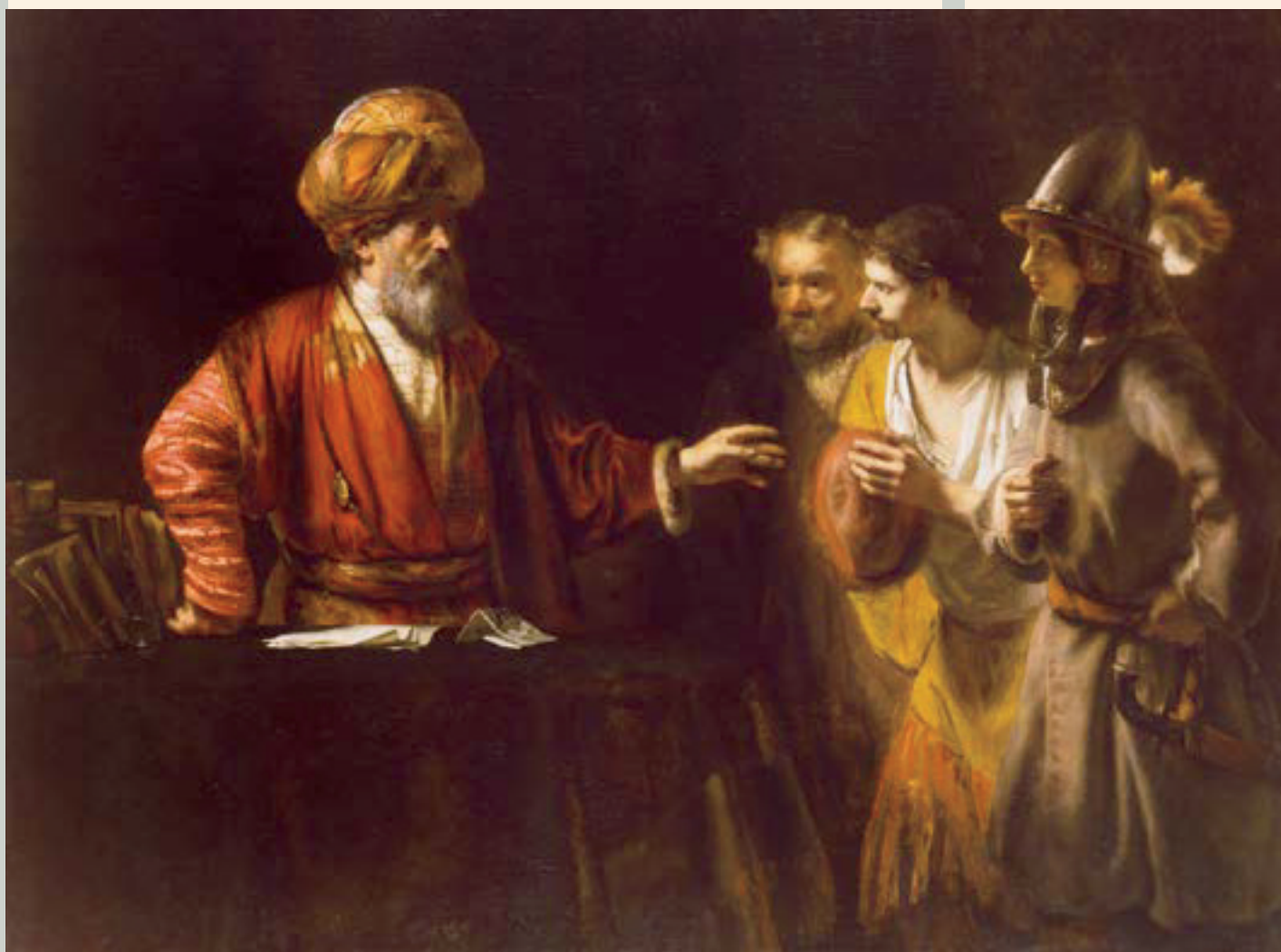
The Parable of the Unjust Manager, Follower of Rembrandt, c.1660 The Wallace Collection, Hertford House, London