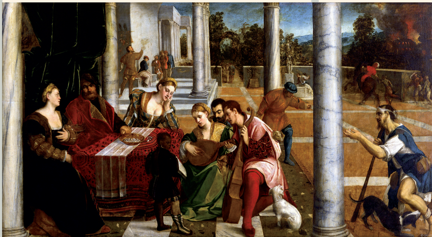
The Parable of the Rich Man and Lazarus, Bonifacio De' Pitati detto Bonifacio (Veronese), 1540 Gallerie Accademia, Venice