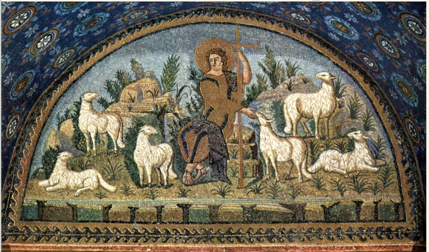
Mosaic of the Good Shepherd, 5th century Mausoleum of Galla Placidia, Ravenna