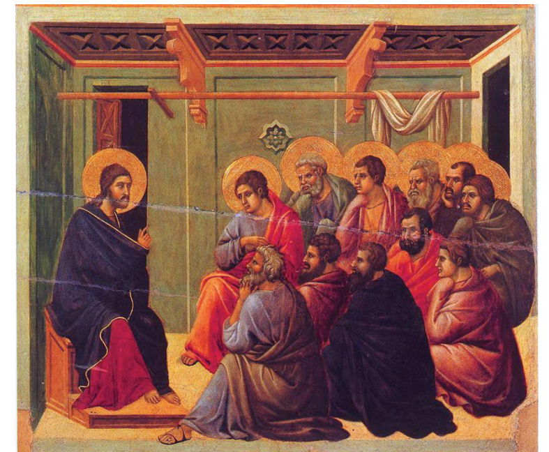
Jesus taking leave of his disciples at the Last Supper, Duccio di Buoninsegna (1308-1311)